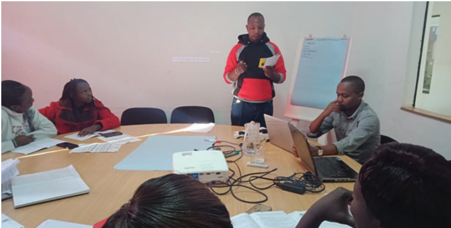
Staff members during the training.

Having completed the KS 1758 implementation and training tools, FPEAK continues to train export companies staff on KS 1758. The training sessions create awareness and equip on the requirement for compliance to the standard. Two companies based in Naivasha have been trained and more will be in the coming weeks..