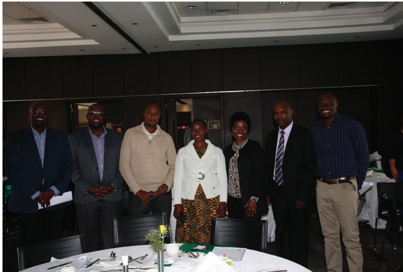
Participants and Board members at the AGM

The AGM was a valuable opportunity for FPEAK members to take stock of developments within the organization and review performance of FPEAK to date.