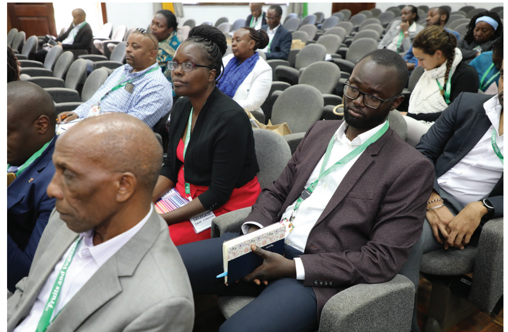
Delegates at the conference and exhibition