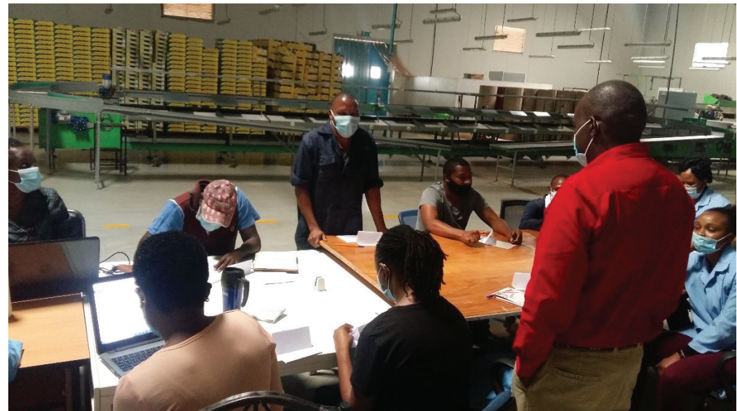
FPEAK Staff conducting farmer group training sessions