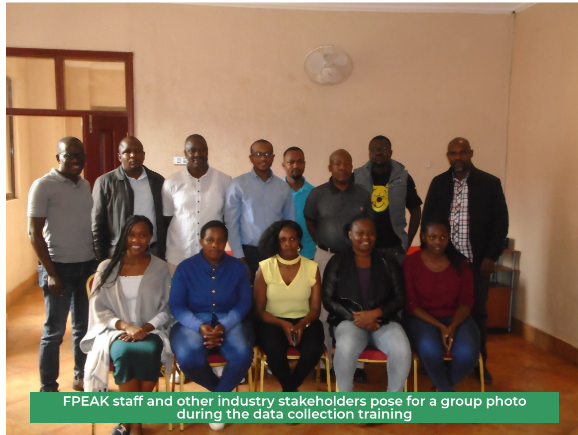
FPEAK staff and other industry stakeholders pose for a group photo during the data collection training