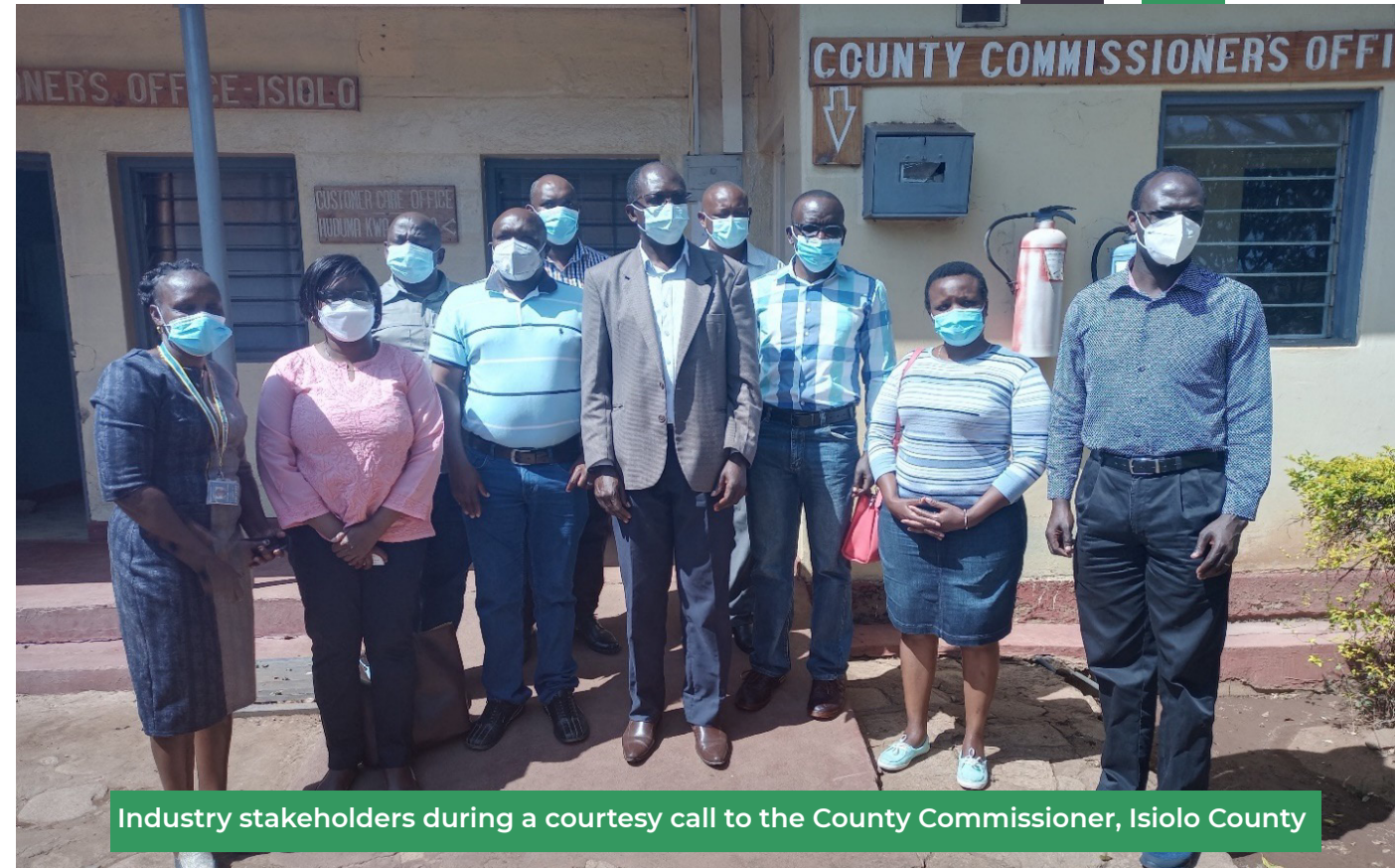
Industry stakeholders during a courtesy call to the County Commissioner, Isiolo County